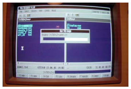
Flex Navigator the file manager for sprinter computers

Navigator, (see pic below). This app reminds me of DiskMaster for the Amiga, or Midnight Commander under *nix machines. With it you can move large quantities of files. Please note that you have absolutely no control over the CDROM under DOS: there are 2 applications, for CDROM viewing and Music CD Playing. Flex Navigator also allows you to execute files from it, but you cannot archive files with it (there is the ZIP utility for sprinter).